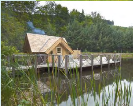
New Sauna on pillars in Swimming Lake