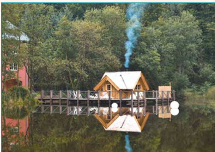
New Sauna on stilts in the bathing lake