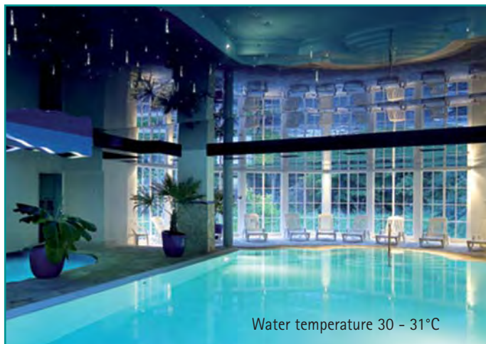
Water temperature 30 - 31°C

Maps for the various destinations can be obtained at the reception