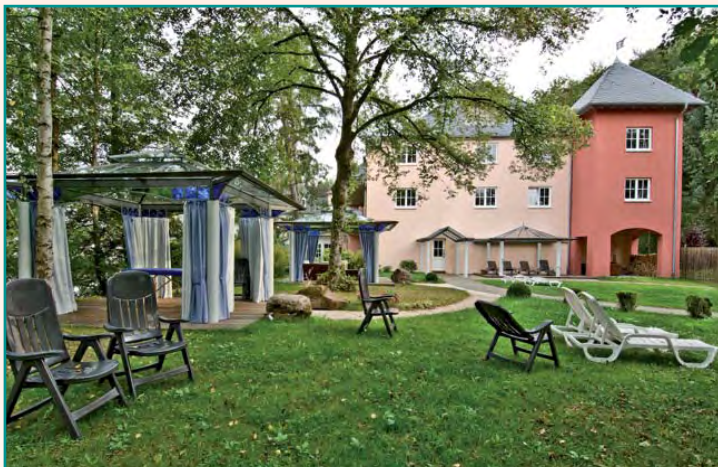
Meadow with Massage Pavillons